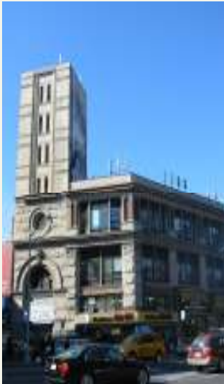
2 - 6 Nevins St. Today

the completion of the Brooklyn Bridge in 1883 and the opening of the Fulton Street "El" in 1888 had pushed the center of Brooklyn shopping further up Fulton Street, away from the Fulton Ferry. The buildings were modified after a series of dramatic fires over a 50 year period.