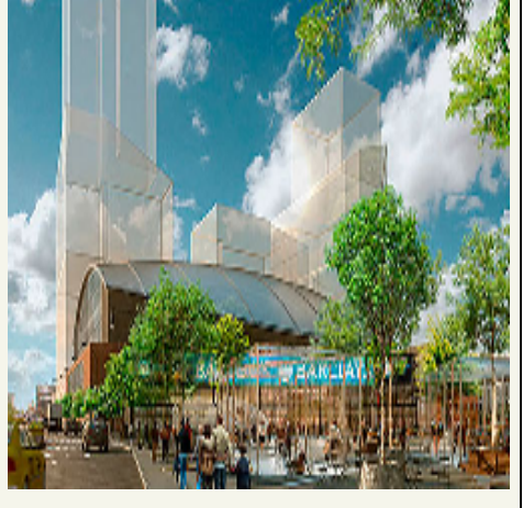
The current plan shows the revised arena design.