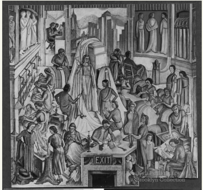
(Left) The Brooklyn Industrial High School for Girls, 1946, the year in which 156 diplomas were given out. (Right) A 1936 mural depicting the many vocations taught at the school.

Savings Bank. The main building is in the setback style, with a roof in the arc and angle design. Materials include granite, stone, terrazzo, and colored marble. Several murals still exist that were commissioned as government art projects in the 1930s.